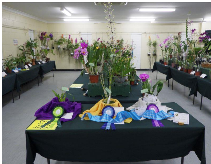
Figure 1 Autumn Show Champions table.

Despite the unseasonal weather for this time of the year – heavy rain followed by oppressive heat – members of the Townsville Orchid Society Inc managed to put together an impressive display of colour and shape at the Autumn Show. This was held at our regular venue – our own Orchid Hall – from Friday 5 th - Sunday 7 th April. Fortunately, there was a welcome break from the rain and the weekend turned out to be perfect for the public, who made the most of the ideal conditions.