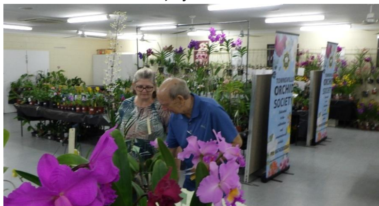
Figure 6 Setting up the Champions table, with the Sales plants in the background.

The vendors had a very successful weekend, with the Sales area overflowing with orchids and foliage plants. The success of the Autumn Show can be put down to the help from a strong Committee and membership. Our Winter Show will be held on July 5 th – 7 th .